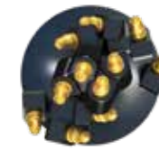
ROCK AUGER (DR4, DR6) ROTATING ROCK PICK TEETH (SHALE/ FRACTURABLE ROCK)