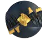
EARTH AUGERS (A4, A6) BLADED TEETH EARTH/CLAY/SHALE