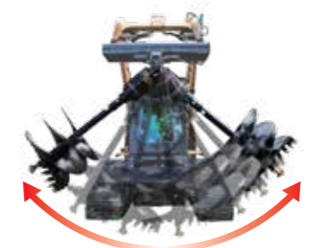
SWING WITHOUT SCS