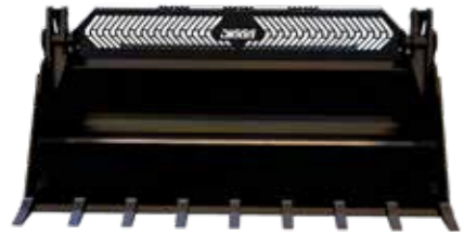
Super Heavy Duty models also available