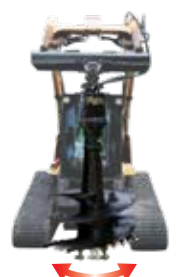
SWING WITH SCS