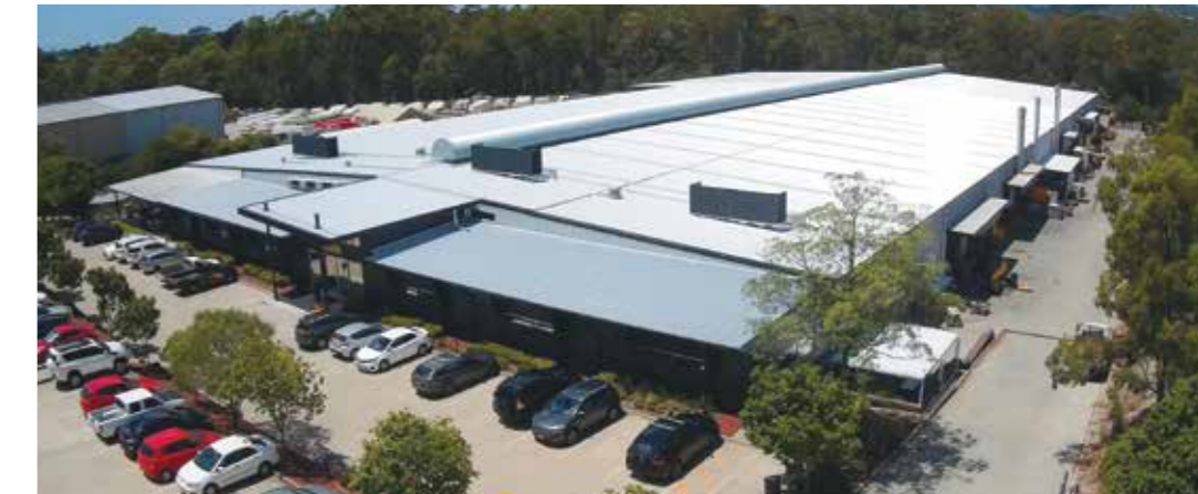
Digga's 12,500m 2 (130,000 sq ft) state of the art manufacturing facility, Brisbane Australia.